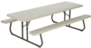
8' Lifetime picnic table $350 - need 10