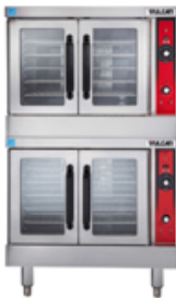
Double stacked convection oven $10,000