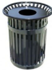
Heavy Duty trash bins - $850 need 10