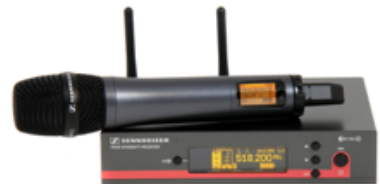
Wireless Microphone for chapel $600 need 2