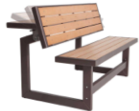
Lifetime convertible benches $150 - need 8