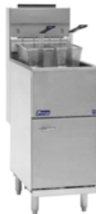
Deep fryer $1200