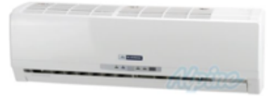
Cooling/heating split system for lower cabins - $2300 need 8