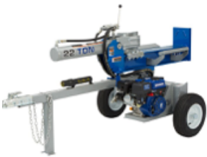
Log Splitter - $1100

We want to thank you in advance for your gracious giving. We thank those who contributed toward this list during our annual fundraising banquet. We value our partnership in ministry and we praise God for you and your investment in the camp. If you have any questions please contact us at info@camparev.org