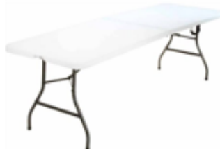
6' Lifetime table $100 - need 7